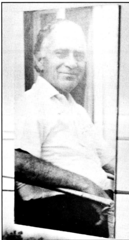
This photograph of Edgar Snow was taken from one hung at Beijing University that was included in an exhibition of Snow memorabilia.

Hounded out of the United States during the McCarthy era for his favorable reports on a communist movement, Snow died in Switzerland