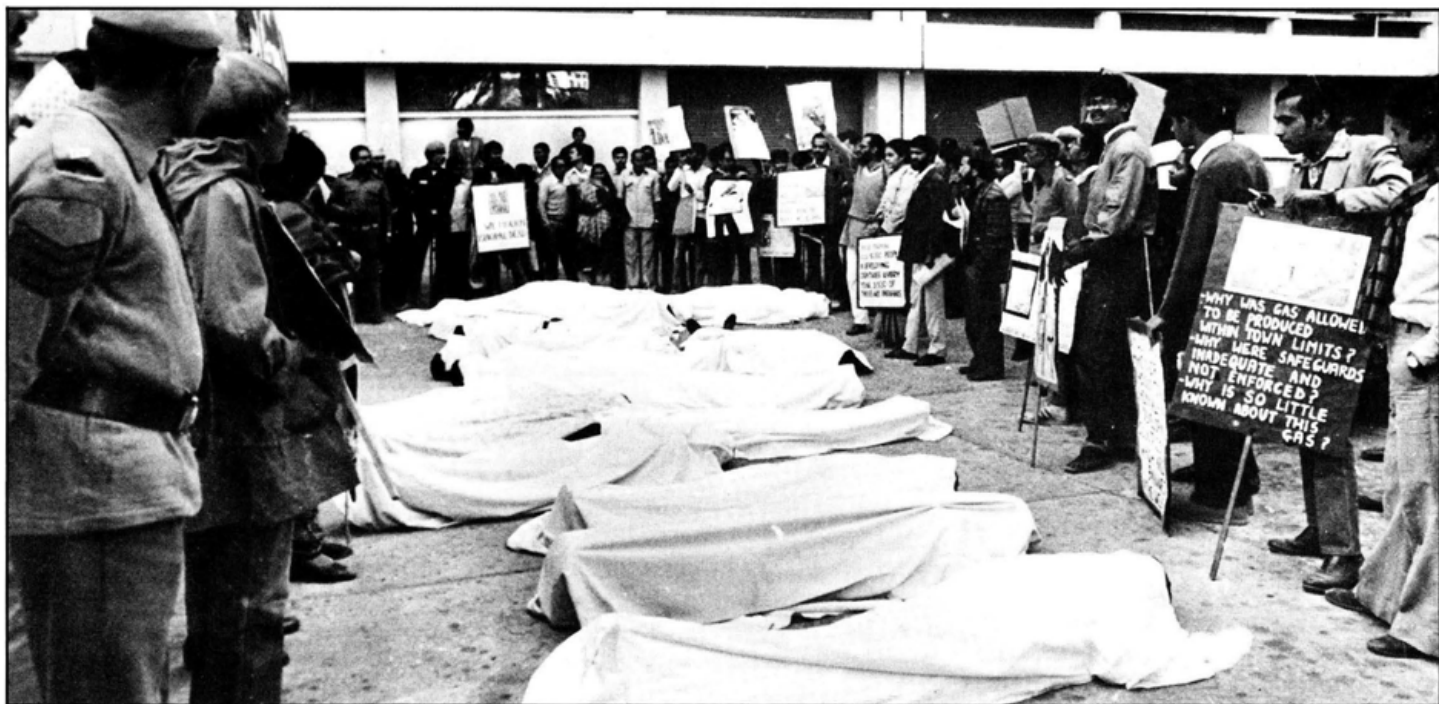
One year later: A staged first anniversary remembrance of the Bhopal tragedy. Mock corpses are surrounded by demonstrators carrying placards asking why so many people were allowed to move their huts so near the Union Carbide plant.

Photographs by Teki Tanwar, chief photographer of The Statesmen, New Delhi.