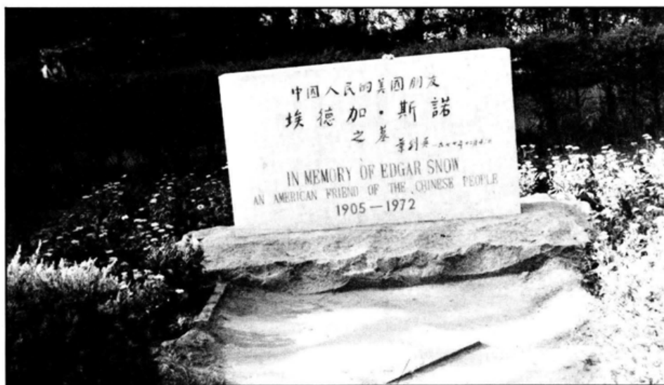
Edgar Snow's grave with the marble plaque honoring him rests on the grounds of Beijing University.

creasing popular Chinese dismay over Chiang's priority to fighting the Reds over resistance to the Japanese.