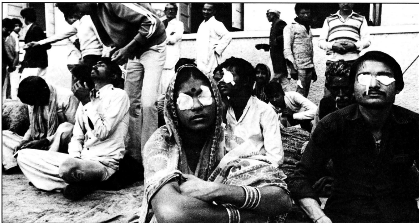
Victims receive medical treatment for their eyes on the day of the poisonous gas leak — December 3, 1984. Many of the 200,000 injured suffered blindness.