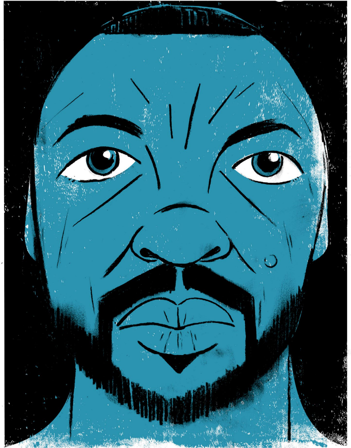
ILLUSTRATION BY EDEL RODRIGUEZ

He couldn't look me in the eye; he was extremely embarrassed. It was a short meeting, and I left feeling