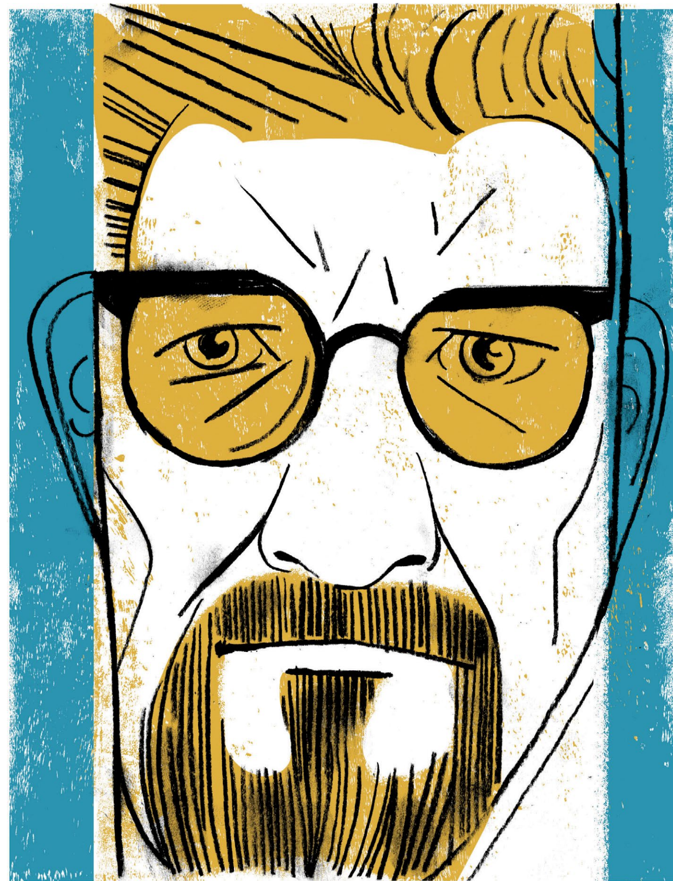
ILLUSTRATION BY EDEL RODRIGUEZ

It was a circus, with elephants and tigers and horses and clowns and trapeze artists under a big top, with a