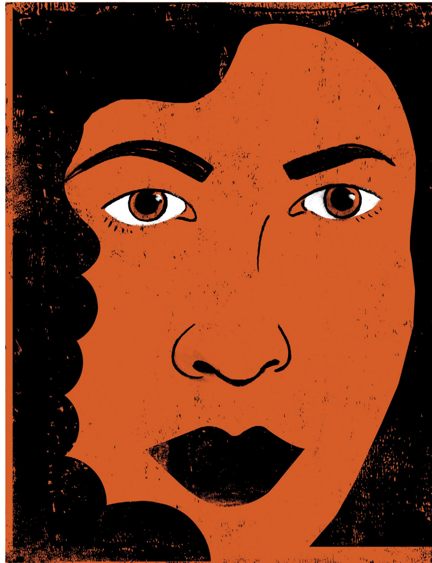
ILLUSTRATION BY EDEL RODRIGUEZ

By 2008, the 40th anniversary of Dr. King's assassination, I'd become the first Black woman to be a columnist for Memphis' daily paper. Often, I wrote about topics